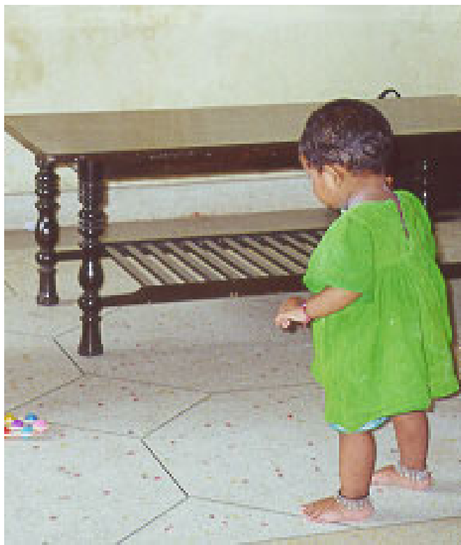
12. Stunted girl 1 year, 0 month 67.8 cm, 7.6 kg