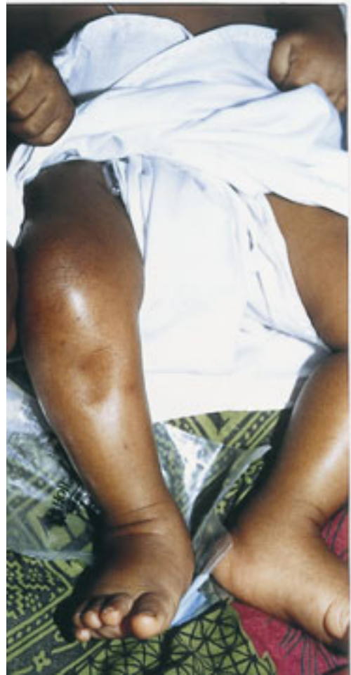
7. Oedema of both feet