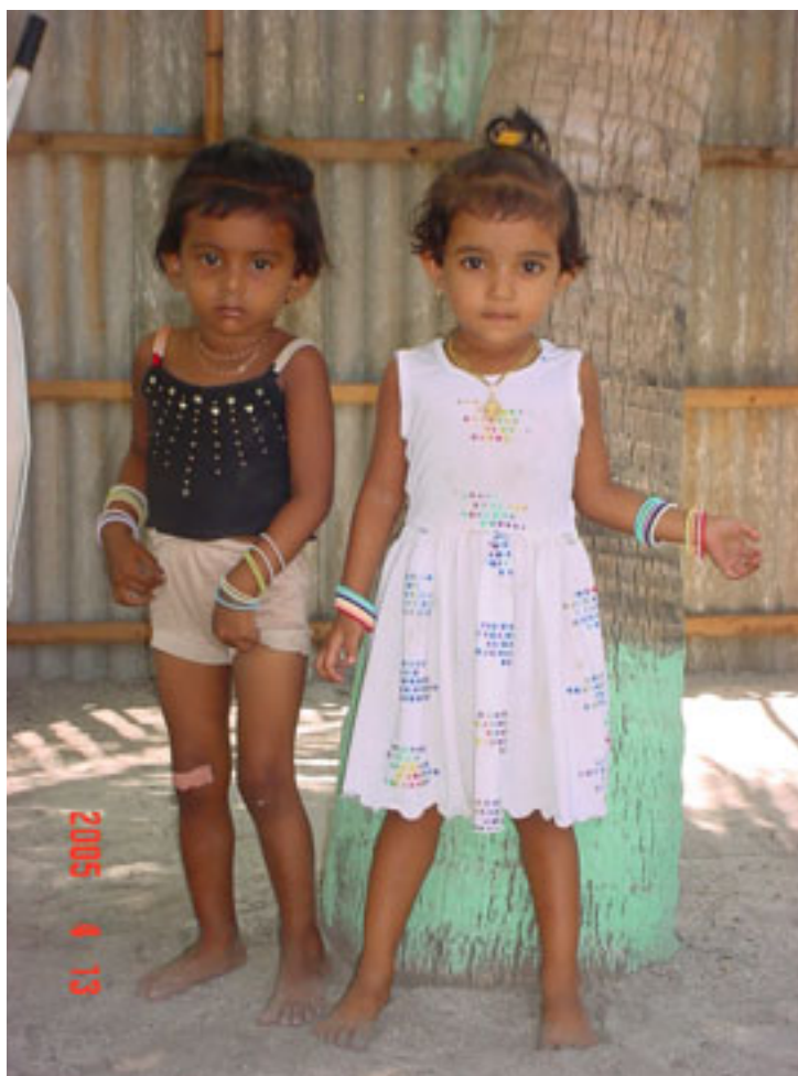
13. Two girls