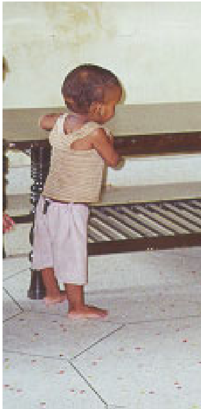
9. Underweight boy 1 year, 1 month 70.3 cm, 7.5 kg