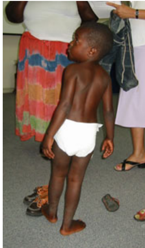
10. Normal weight boy 3 years, 11 months 109.6 cm, 19.5 kg